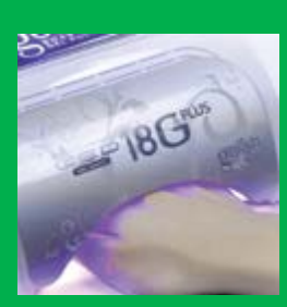
STEP 3 Cure 60 seconds in 18G LED Light.

30-50 applications per tube, depending on sculpt or overlay application.