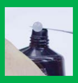
STEP 1 Squeeze, slice, and roll. Squeeze just the right amount of PolyGEL* out of the tube, slice product with your PolyTOOL*. Roll onto nail.